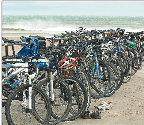
Bicycles waiting for their riders at the Triangle Triathlon Duathlon on Sunday morning. 14280KDR

Last Sunday was hard core Duathlon for the truest aficionados. Anyone who turned up had four seasons to enjoy in one day, the beauty of nature to marvel at and also the red hot heat of local competition – what more could you ask for a fiver?