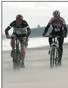
Cyclists ride through the sandstorm at the Triangle Triathlon Mountain Bike Duathlon challenge on Sunday.