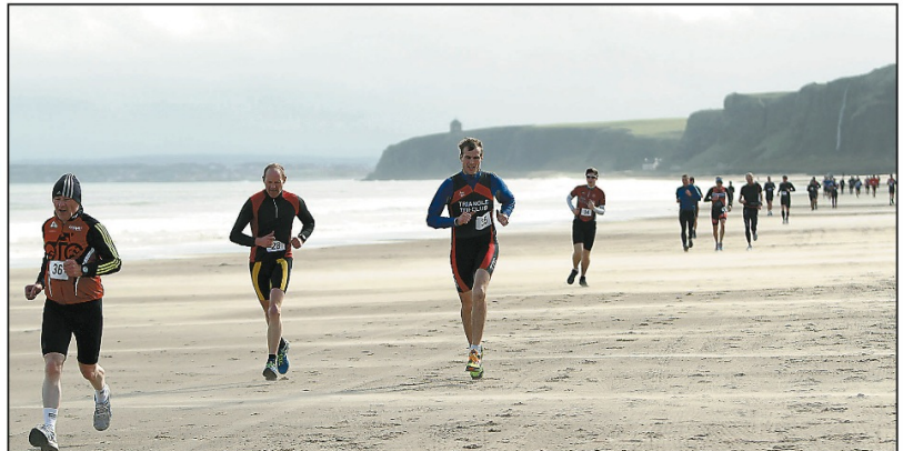
Athletes pack Benone beach as they part in the Triangle Triathlon Mountain bike duathlon on Sunday. 14298KDR